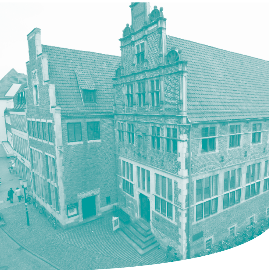
The 'Haus der Niederlande' in the city centre of Münster