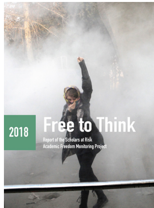
Free to Think 2018