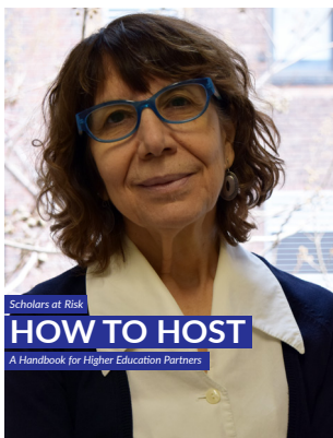
How to Host

These SAR publications and other activities can be found online at scholarsatrisk.org .