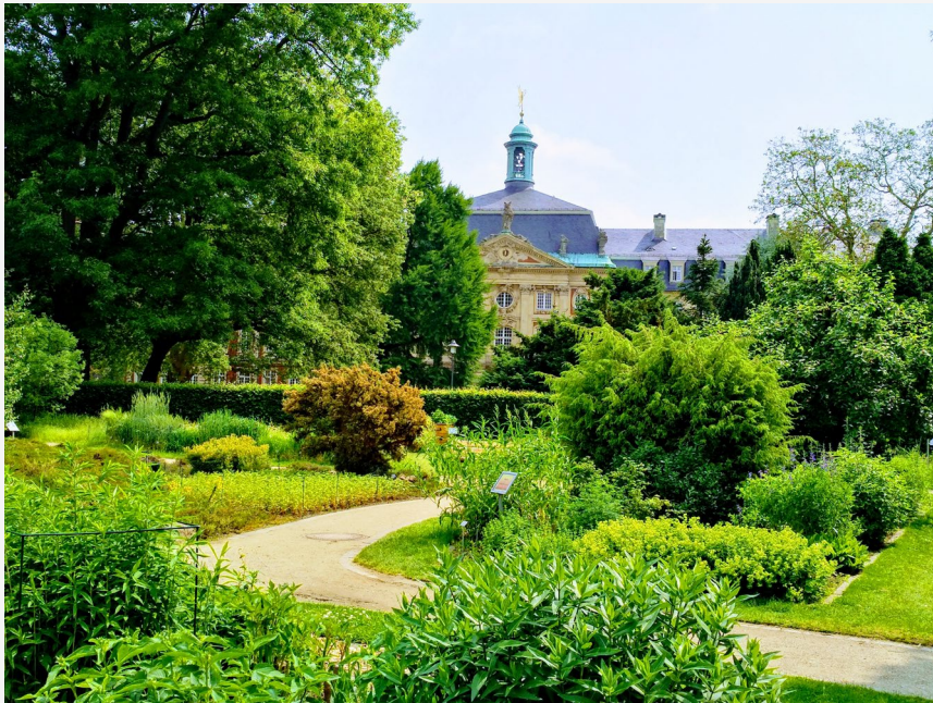
Der Botanische Garten.