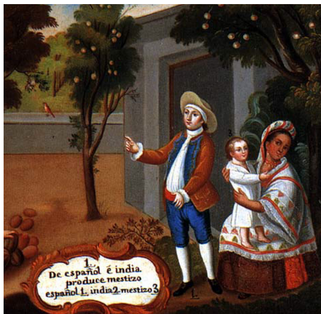
Image: Unknown author, 1780, Colección de Malu y Alejandra Escandón, via Wikimedia Commons, public domain.

The project aims at tracing the origin, dissemination, translation and adaptation of the categorization in the early modern Americas. It studies practices of mestiz@s and their families and processes of belonging and migration in a transimperial approach.