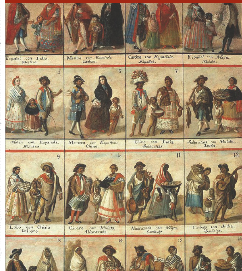
Image: Anónimo, siglo XVIII. Museo Nacional del Virreinato (Tepotzotlán), via Wikimedia Commons, Public Domain.