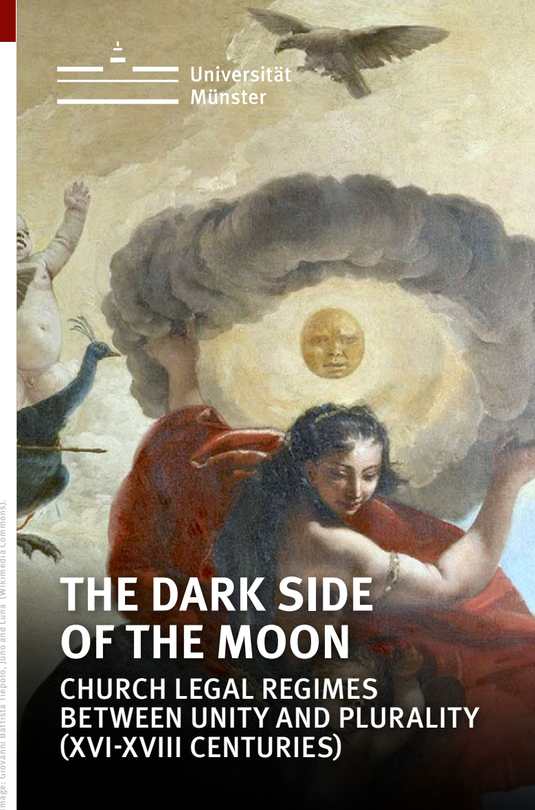
Image: Giovanni Battista Tiepolo, Juno and Luno (Wikimedia Commons).