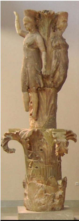
FIG. 2: Delphi 1548. The Akanthus column in Delphi