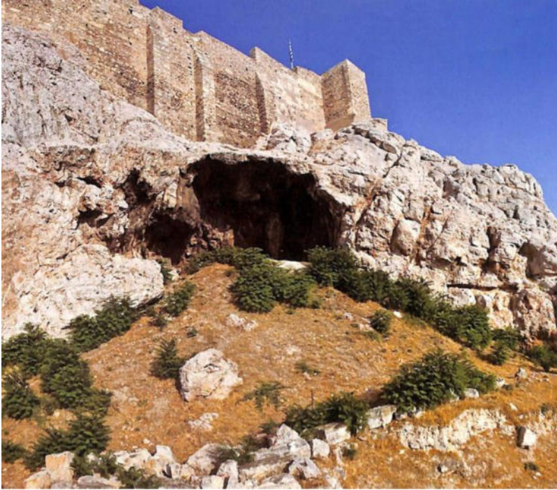
FIG. 1: The sanctuary of Aglauros on the east slope of the Acropolis