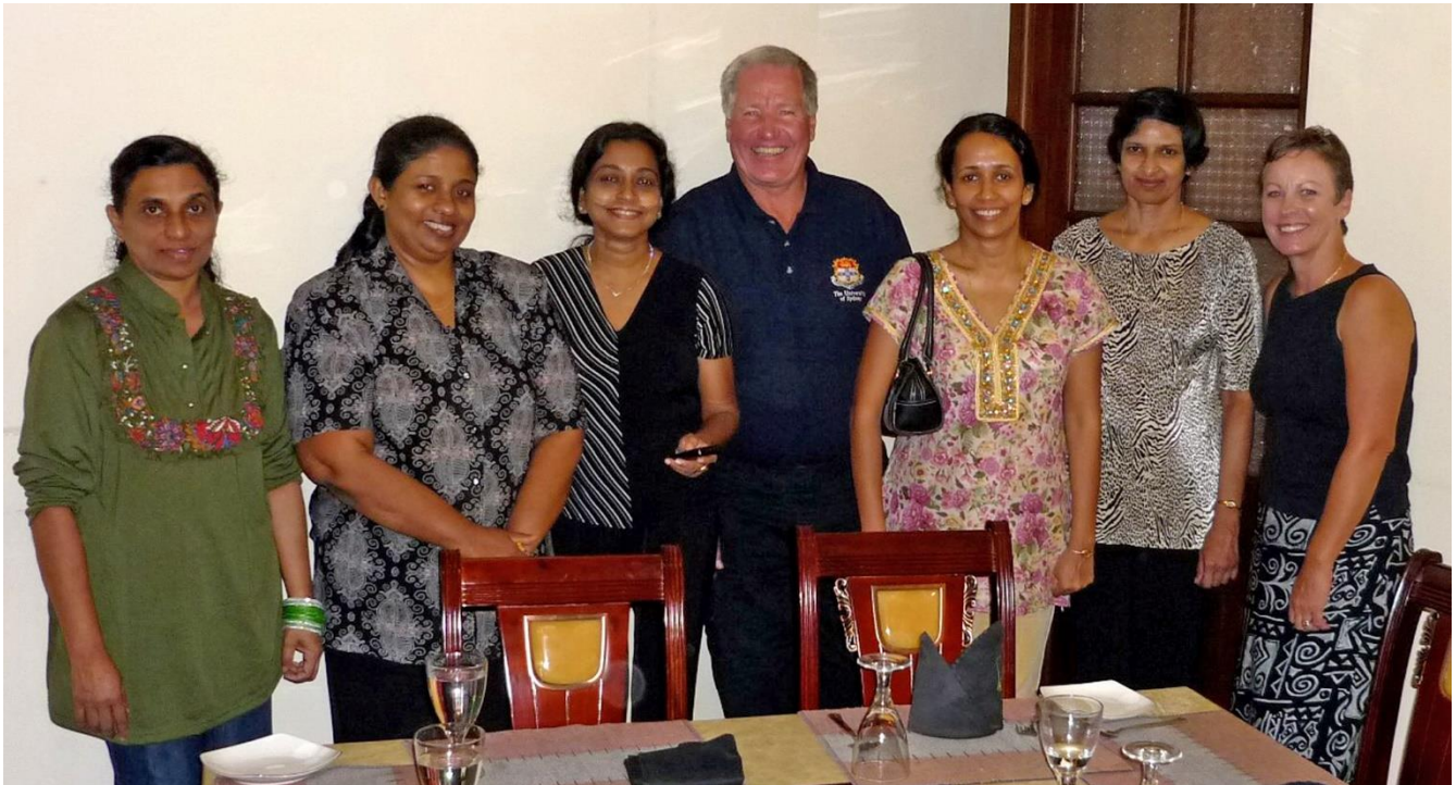
Figure 13: Farewell luncheon with all of the examiners at the University of Colombo after completion of the examinations for Postgraduate Anatomical Pathology in 2002.