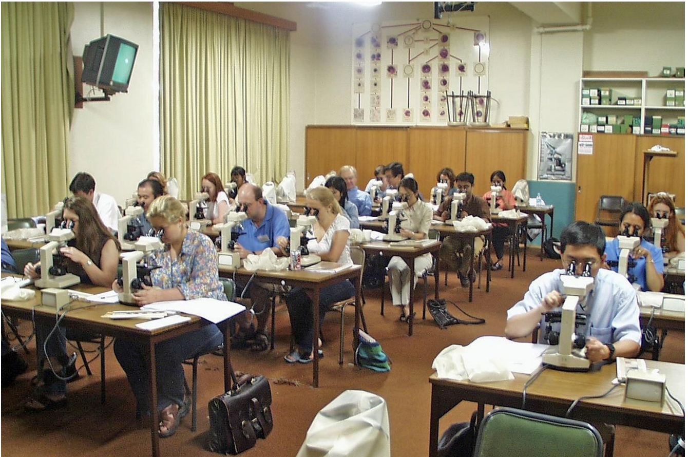
Figure 10: Students at our annual Postgraduate Neuropathology Course at the University of Sydney studying the histopathology slides for the course in 2004.

might be suitable for the brain bank the NISAD staff called the relatives of the deceased to ask if they would consider donating their loved ones brain to the brain bank – a tough job!