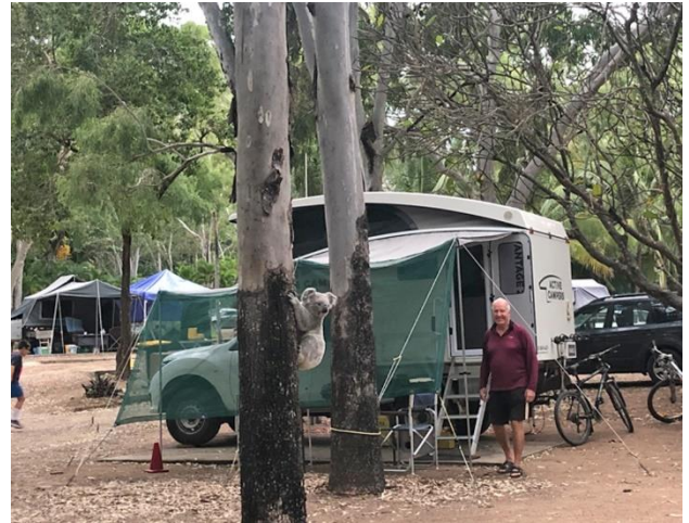
Figure 14: Camping in 2021 on Magnetic Island in Queensland with the local Koala.

swim, cycle, sail and travel in our 4x4 camper rig. Last year we were on the road, around Australia, for seven months! After Covid we hope to travel overseas again to meet up with our international colleagues and friends.